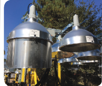
Example of directional work lighting