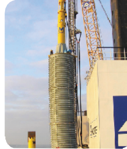
Example of noise control shroud (marine environment)