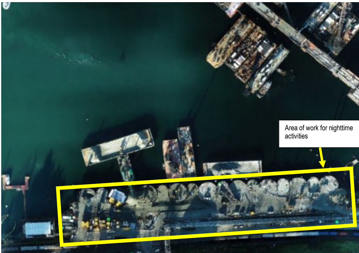
Figure 1: Location of WMT nightwork activities