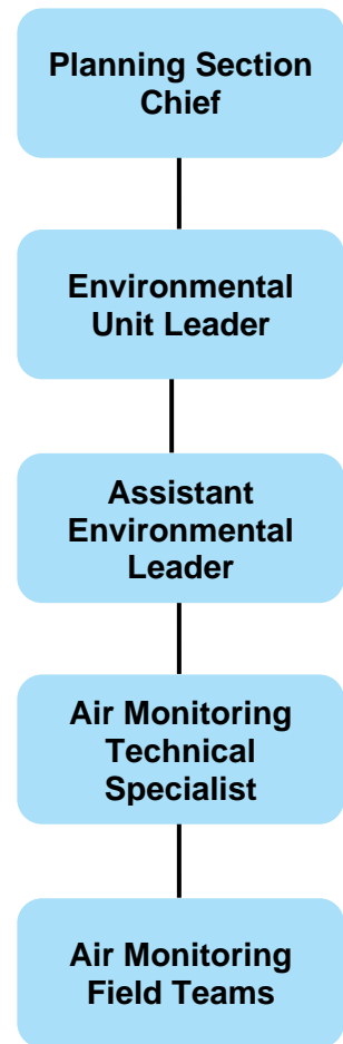
Figure 1: Air Monitoring Positions Under Incident Command System

The Air Monitoring Team is part of the EU and is responsible for performing air monitoring in accordance with the Air Monitoring Plan. The Air Monitoring Team is comprised of pre-identified third-party contractors based on technical knowledge, relevant experience, and response times. The third-party contractor will mobilize to the location of the incident and begin ambient air monitoring as soon as possible once the Air Monitoring Plan has been initiated. Contractors are listed in the Incident Notification Guideline located in the Emergency Toolkit.