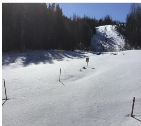
Access road of bridge installation at BCVA-246a near KP 968–969.

The Indigenous Monitor inspected the area before construction activities commenced. Ongoing monitoring will be conducted at such sites as construction continues.