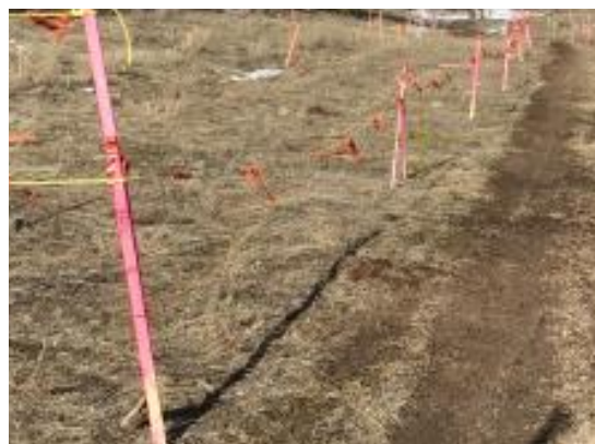
Appropriate signage and buffers confirmed.