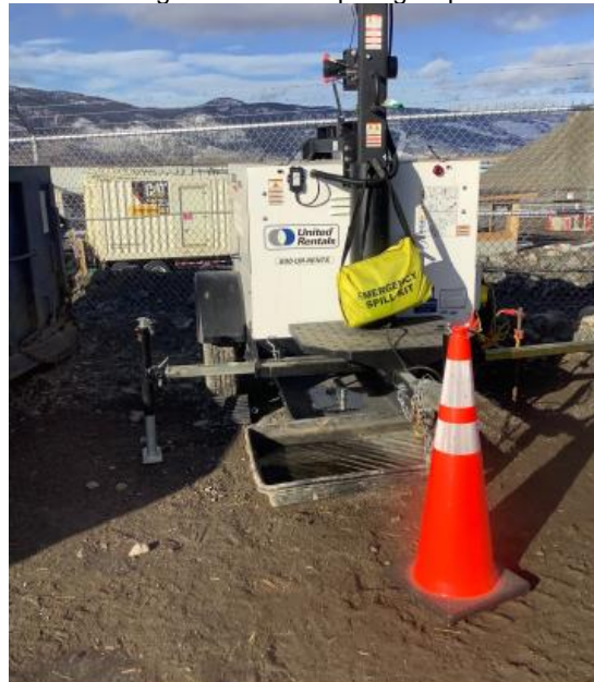
Secondary containment requiring drainage from snow melt.