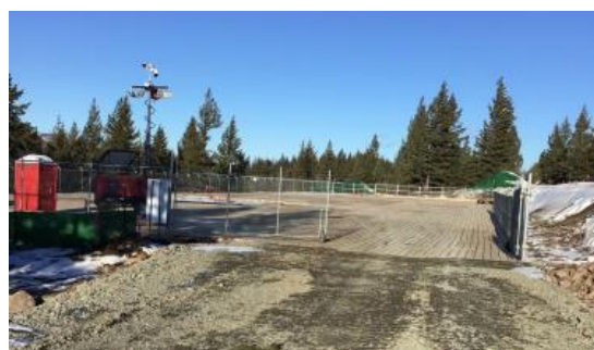
Bore pad construction at KP 855 near Jacko Lake.

Sediment fencing, culverts and drainage were inspected at access road 4 at KP 855. Repair of sediment fencing was recommended and implemented immediately by the contractor. There were no further concerns identified at this location.