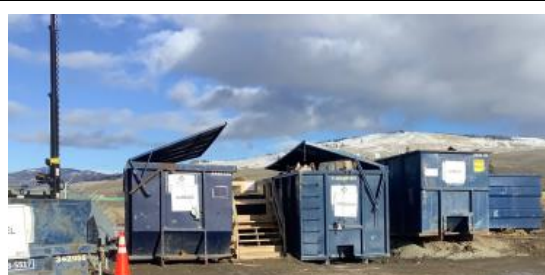
Waste management bins requiring disposal.

During the inspection, the Indigenous Monitor identified misplaced debris, garbage and recycling, which was brought forward as a deficiency and addressed. Spill kits were inspected for volume and types of spill response material and to ensure the appropriate placement in relation to work fronts. Drip trays were inspected under stationary equipment to make sure they were present when parked. A drip tray that had accumulated water from snow melt was identified. The deficiency was addressed, and the fluids were properly drained from trays.