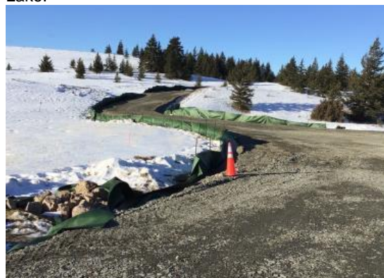
Access road 4 at KP 855 near Jacko Lake.