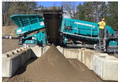
Power screening Laidlaw Road material from Dent pit.