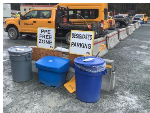
Skagit yard inspection for general housekeeping.

Key aspects of the site inspections included housekeeping and waste management with corrective actions noted such as proper waste disposal and using drip trays. In addition, spill kits and spill response procedures were reviewed and implemented. Loose miscellaneous debris was identified, disposed of and corrective actions were taken.