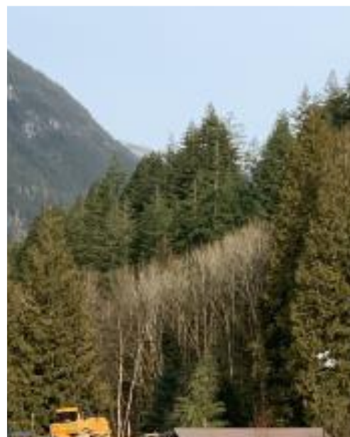
General area of chance find.

Near Road 50, the Indigenous Monitors participated in the implementation of the TLU Site Discovery Contingency Plan near a potential TLU site. The Indigenous Monitors and Environmental Inspectors examined the site to collect initial information and flagged off the area for additional evaluation. Resource Specialists and Knowledge Holders of Indigenous Monitors' communities were contacted for evaluation and feedback. The site was determined to be of no cultural significance. No further action was required.