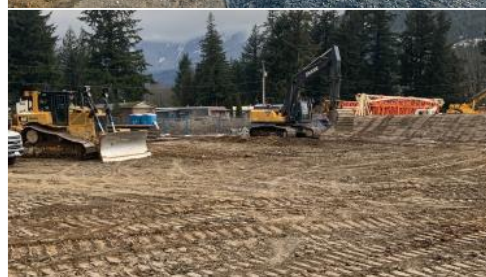
Images of topsoil stripping at Road 59.