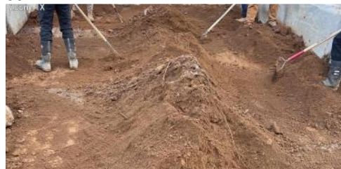
Raking soil near Road 50; archaeological assessment.