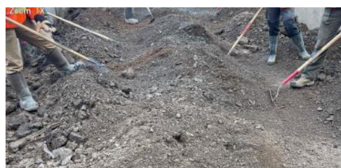
Archaeology screening and raking near Road 50.

If an archaeological site is found, Trans Mountain completes the applicable reporting and applies for the required permits in alignment with the Heritage Conservation Act. Engagement with Indigenous groups occurs when a previously unidentified site is discovered. Ongoing AIA activities continue in the Hope region.