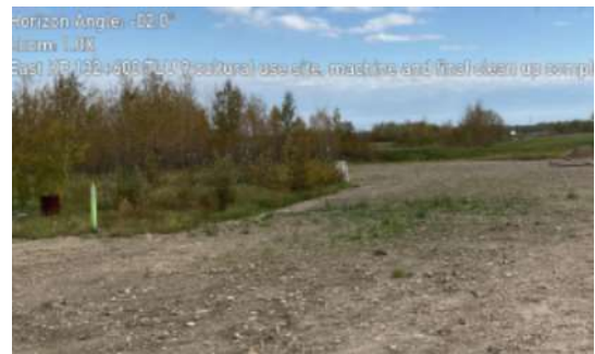
Reclamation complete TLU-9.

An Indigenous Monitor also performed an inspection on a plant gathering site. The Indigenous Monitor confirmed no chemicals have been sprayed in the TLU site, construction is confined to approved work boundaries and that boundary signage is in place. Inspected mitigation measures remained in compliance. No cultural or environmental concerns were identified.