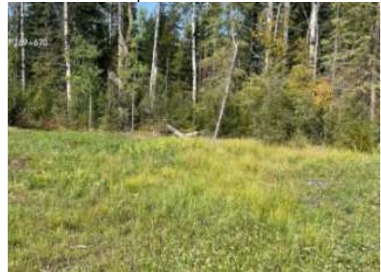
Regrowth at TLU-26.