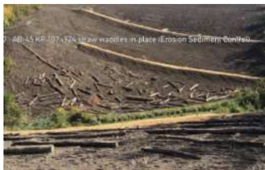
ESC installed on hill; seeding complete near KP 107.

Indigenous Monitors inspected ESC mitigations, including wing walls and silt fencing through wetlands and watercourses between KP 50 and KP 132 on Spread 2. Indigenous Monitors inspected erosion control blankets secured with willow stakes, rock armouring, swales and placement of CWD in and around the several watercourse crossings and steep slopes. No deficiencies were identified.