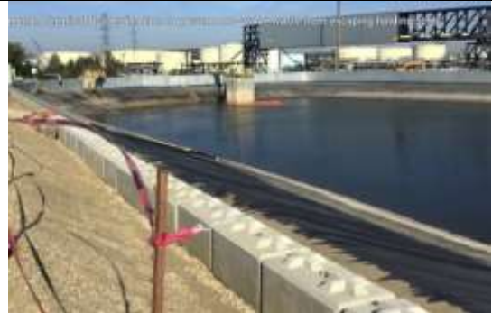
Containment basin complete Edmonton Terminal.

Waste management was inspected as well as secondary containment for equipment and fuel storage tanks. Walking paths were kept clear. Spill kits and spill response procedures were also reviewed in the field. Key compliance measures on the construction permit were reviewed and mitigations were in place.