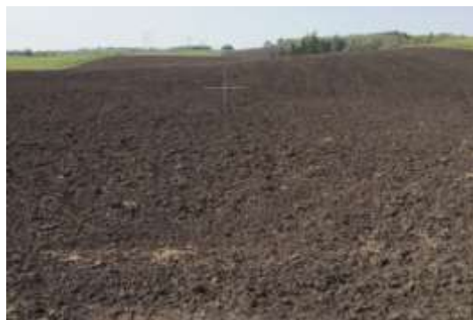
Reclamation complete KP 126.

Indigenous Monitors were on-site inspecting various reclamation activities on Spread 2, including discing for soil decompaction, topsoil replacement, confirming topsoil depth and seeding. Indigenous Monitors were engaged in conversations with crews and Environmental Inspectors about the different stages of reclamation. Indigenous Monitors discussed the need to postpone topsoil replacement in wet or windy conditions to prevent damage to soil structure or erosion of topsoil with Environmental Inspectors. All compliance objectives were confirmed in place.