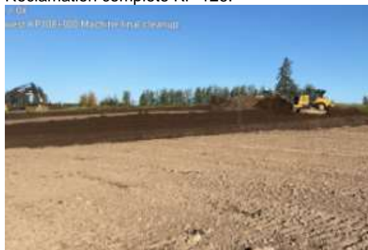
Topsoil replacement KP 108.