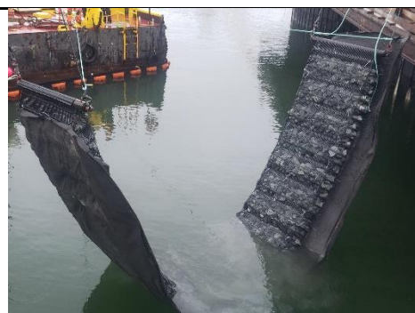
Rock reef bed matting being placed in one of the nursery reefs at WMT.

TMEP has participated in consultation specific to the proposed habitat offsetting with Vancouver Fraser Port Authority (VFPA), municipal governments, First Nations, non-governmental organizations, members of the scientific community and the public, and has incorporated feedback into the offsetting design.