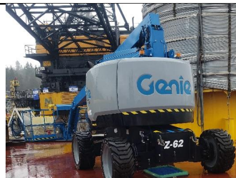
Secondary containment placed under machinery inspected at WMT.

The Indigenous Monitors conducted housekeeping inspections at Burnaby Terminal and WMT. Indigenous Monitors also check that secondary containment is placed underneath machinery and stored petrochemicals such as paint and gasoline. At WMT, the Indigenous Monitor inspected the marine loading platforms for site housekeeping measures. No environmental concerns were identified.