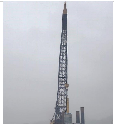
The DB General preparing for impact pile driving at Berthing Dock 9 at WMT.

During impact pile driving, noise shrouds and underwater bubble curtains are installed around the pile to reduce underwater noise levels. Analysis of