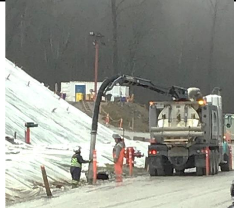
Hydrovac cleaning out sediment and debris from a check dam on Lower Road at Burnaby Terminal.

At Burnaby Terminal, the Indigenous Monitor observed the Eagle Creek and Silver Creek tributary realignment diversions were functioning as intended. No concerns were observed as the water being realigned was flowing well and as intended to mitigate any potential sediment migration.