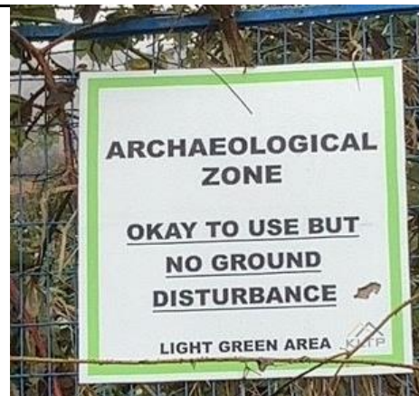
Environmental signage inspected at Colony Farm.

The pipe had successfully been pulled from the HDD borehole at Colony Farm under the Fraser River through to the south side entry site. The Indigenous Monitor observed the removal of protective wooden matting that was used as a portable platform during pipeline construction to create paths for equipment, protect environmental features and avoid ground disturbance. During the removal of matting, the