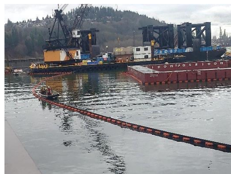
Resource Specialist taking water samples near the adult reef area.