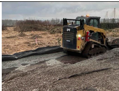
Gravel being removed after protective wooden matting had been lifted at Colony Farm.

The Indigenous Monitor identified a potential chance find during matting removal and participated in the implementation of the Heritage Resource Site Discovery Contingency Plan. The site was buffered to allow for ongoing assessments with the Resource Specialist, IM and EI. As part of the Contingency Plan, Trans Mountain initiated the communication process with Indigenous groups related to notification and engagement on potential TLU and Heritage Resources chance finds. The archaeologist determined the find was not an archaeological site and flagging was removed.