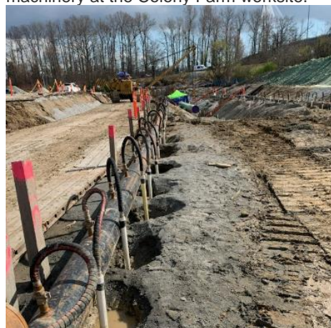
Wellpoint dewatering system at Colony Farm worksite.