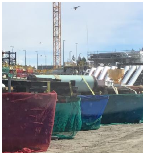
Mesh placed as a nesting bird deterrent in the manifold area at Burnaby Terminal.

At Burnaby Terminal, the Indigenous Monitor participated in discussions with the Environmental Inspector and construction contractor regarding the nesting bird season and mitigation measures such as bird deterrents like hawk kites, mesh netting on areas where birds may try and nest, as well as installation of artificial bird houses. The Indigenous Monitor observed the construction contractor continue to install these wildlife mitigation measures to deter birds from nesting in construction areas at Burnaby Terminal.