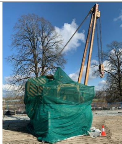
Mesh netting used as a nesting bird deterrent placed around stationary machinery at the Colony Farm worksite.

The Indigenous Monitor participated in the implementation of the Heritage Resource Site Discovery Contingency Plan. The site was buffered to allow for ongoing assessments with the Resource Specialist, Indigenous Monitor and Environmental Inspector. As part of the Chance Find Contingency Plan, Trans Mountain initiated the communication process with Indigenous groups related to notification and engagement on potential TLU and Heritage Resources chance finds. Assessment of the chance find continues.