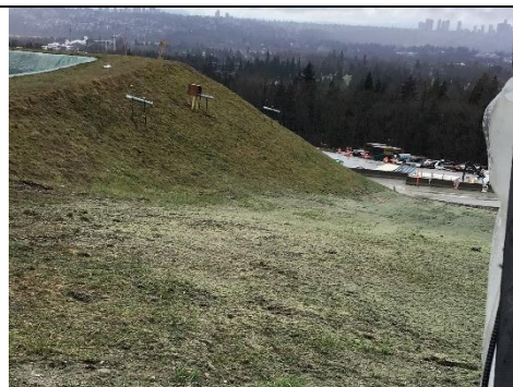
Hydroseed applied to a slope near Reservoir Road at Burnaby Terminal.

At Burnaby Terminal, the Indigenous Monitor observed the Eagle Creek and Silver Creek tributary realignment diversions were functioning as intended. No concerns were observed.