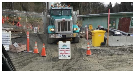
Good site housekeeping at Burnaby Terminal.

The Indigenous Monitors conducted housekeeping inspections at Burnaby Terminal and WMT. Indigenous Monitors also check that secondary containment is placed underneath machinery and stored petrochemicals such as paint and gasoline. At WMT, the Indigenous Monitor inspected the foreshore, barges, marine loading platforms, the Kask Bros. construction yard and the Commissioner Street yard for site housekeeping measures. No environmental concerns were identified.