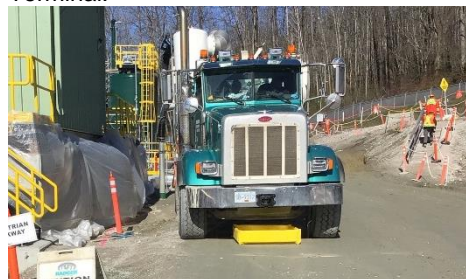
Secondary containment placed under a hydrovac truck at Burnaby Terminal.