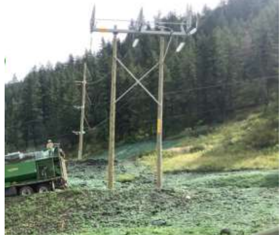
Hydroseeding activities at Black Pines Transmission Line.

Indigenous Monitors continue to monitor the post-construction activity at the Black Pines Transmission Line. The inspections included re-seeding activity in previously excavated and backfilled areas and ensuring correct signage is in place. The Indigenous Monitors also monitored topsoil reclamation and general site housekeeping efforts. No concerns or potential chance finds were documented during the inspection.