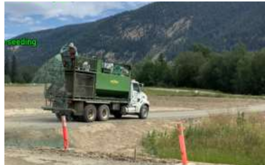
Black Pines pump station hydroseeding and general housekeeping inspection.