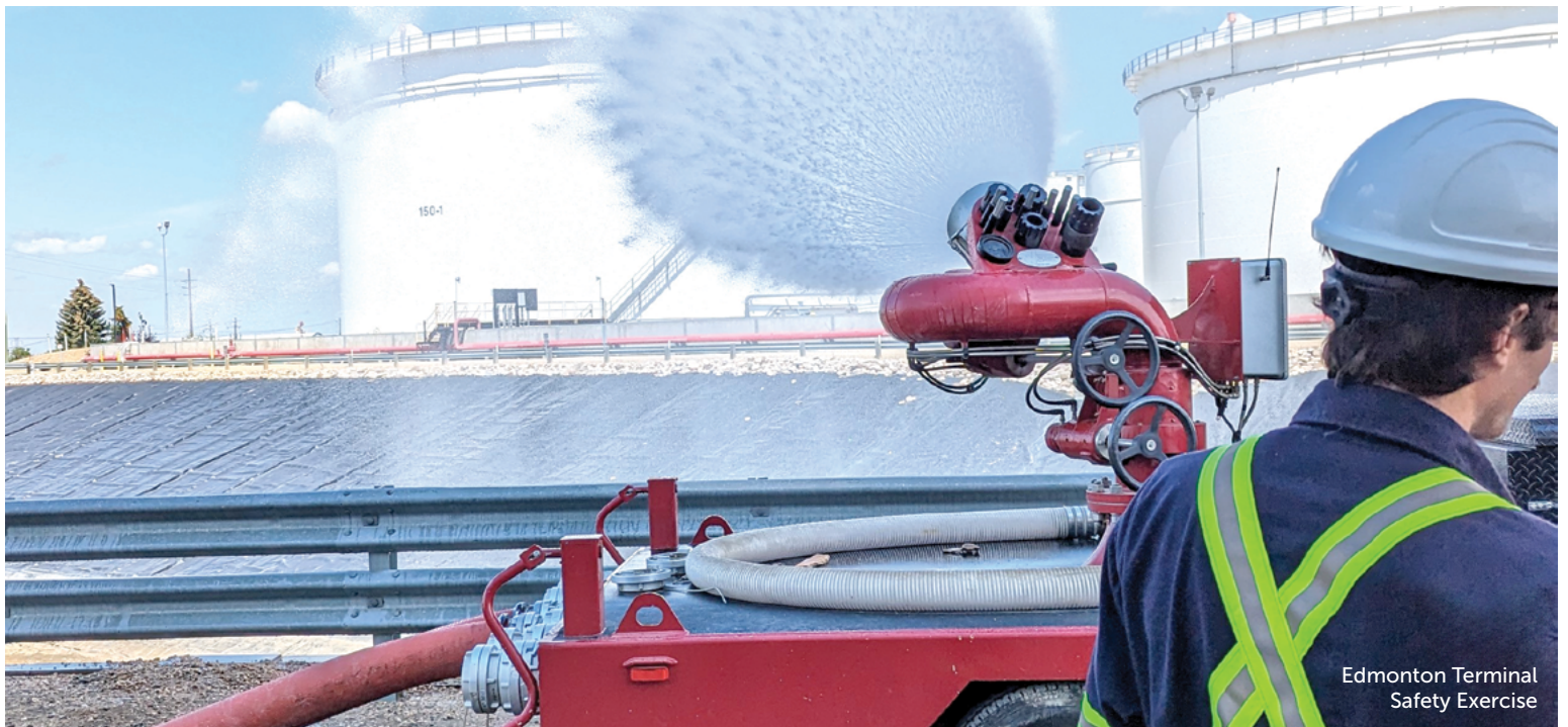
Edmonton Terminal Safety Exercise