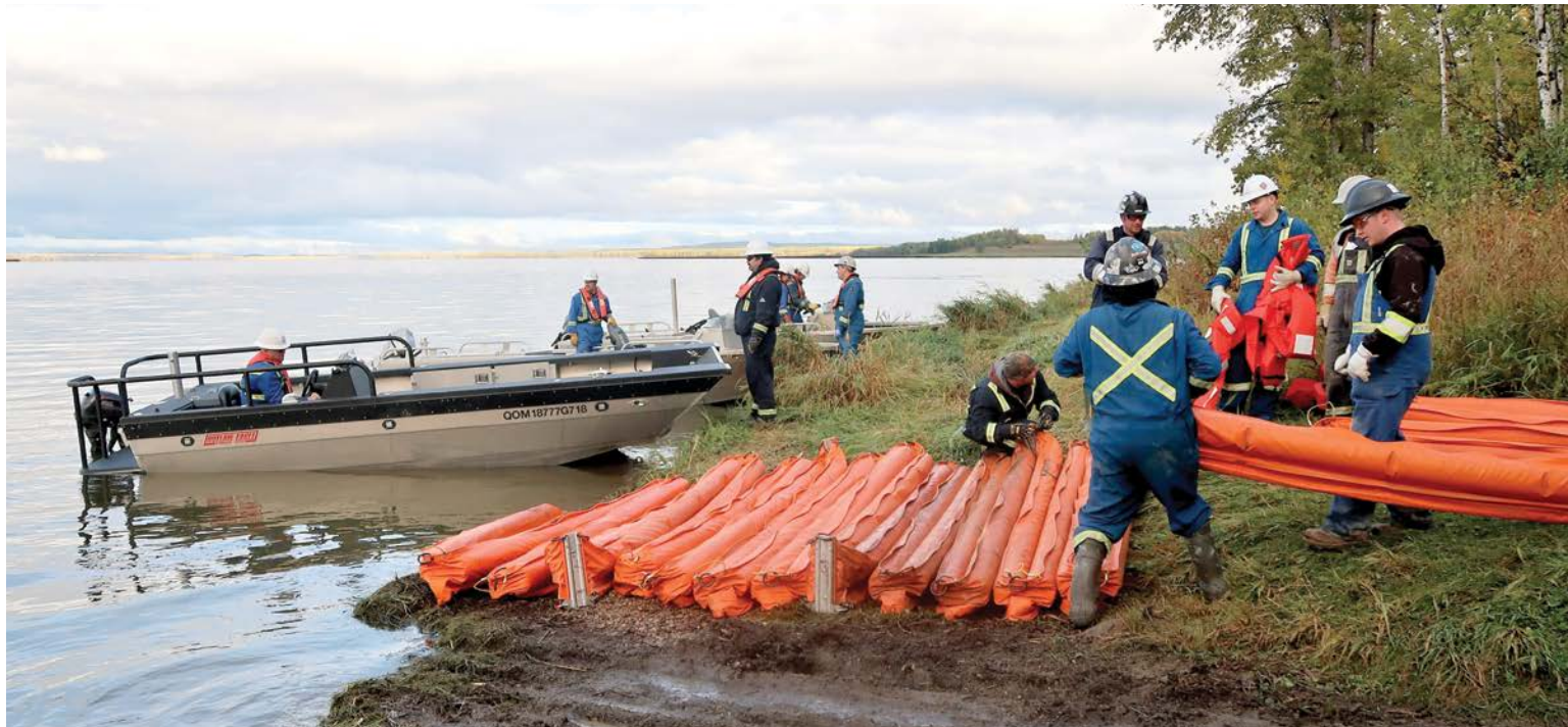
Chip Lake Emergency Exercise