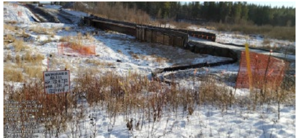
Little Brule bridge installation at KP 172.