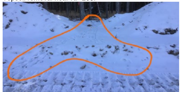
Wildlife using soil breaks near KP 173.