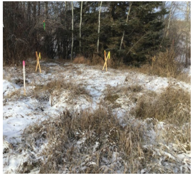
Plant gathering site, plants identified.

The Indigenous Monitors inspected environmentally sensitive areas and TLU sites to ensure the flagging/staking remains in place and that appropriate mitigations are being followed, such as clearly marking all identified areas and buffer zones are the correct distances. TLU sites were inspected with the help of community Elders to provide insight on the types of medicinal plants in the area, the cultural significance of pre-identified TLU sites and to discuss the overall mitigations the Indigenous Monitors and Project follow.