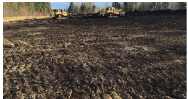
Topsoil removal near KP 205.

The Indigenous Monitors were involved in monitoring and inspecting such topsoil salvage mitigations. The Indigenous Monitors also investigated the construction areas before and after topsoil stripping to identify any potential archeological chance finds. No archeological chance finds were identified.