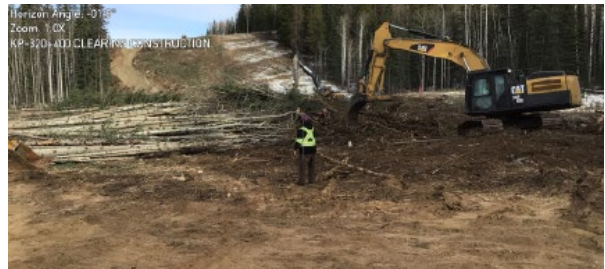
Clearing activities near Hinton AB at KP 320.